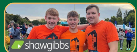
Photo: Three of Shaw Gibbs' runners in the 2024 Oxford Half Marathon

In 2024 Shaw Gibbs chose us as their Charity of the Year and organised a range of internal activities to fundraise for us, including a successful summer party and raffle. They also encouraged staff members to take part in Bike Oxford and the Oxford Half Marathon on our behalf, raising several thousand pounds. Three of their Half Marathon entrants are shown below. In total they had 13 runners, enabling us to have a record 22 runners in our Team for that event!