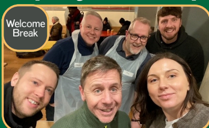
Photo: Volunteers from Welcome Break

Staff from Welcome Break have volunteered at the Gatehouse for several years, offering practical help and a friendly presence while preparing and serving meals or simply being there to lend a hand. They take great pride in supporting their local communities, and have found the experience incredibly rewarding and humbling. Looking ahead, they are excited to grow their involvement, encouraging more of their team to volunteer and deepening the relationship.